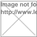
Image not found http://www.lennar.com/images/floorplans/16879_flp3_lg.jpg